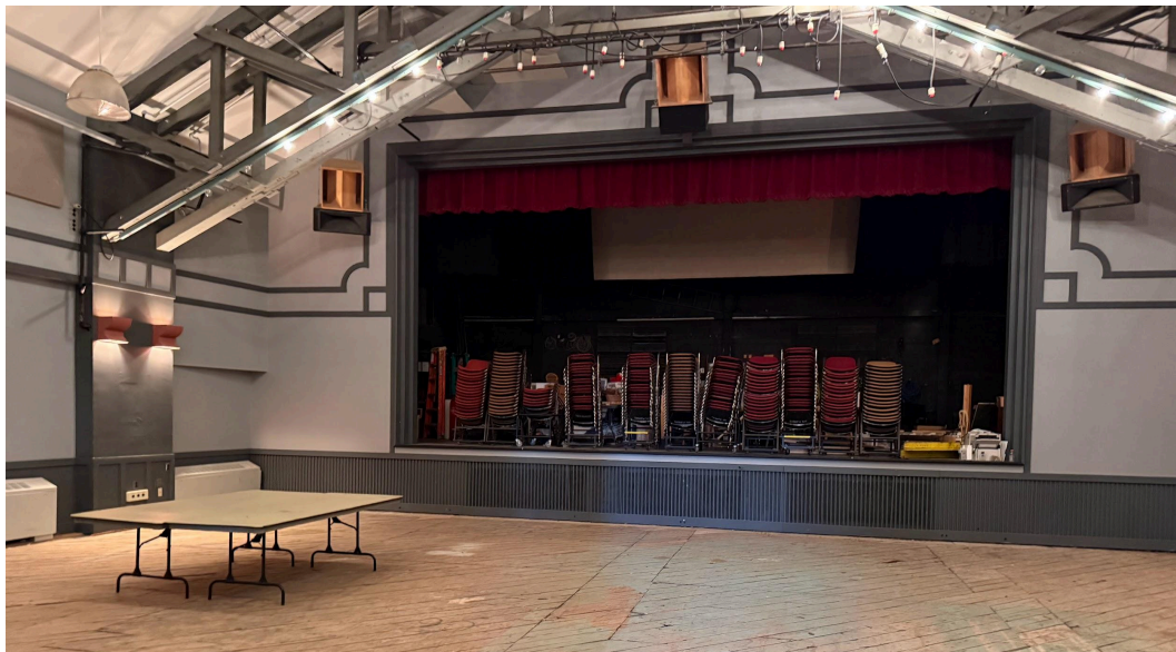
Figure 1: A photo of the Playhouse main stage.