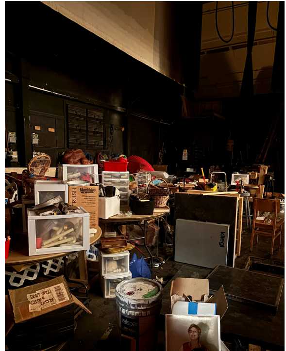
Figure 2: Photo of the mens bathroom. Figure 3: A photo of the Playhouse Stage with belongings still there.