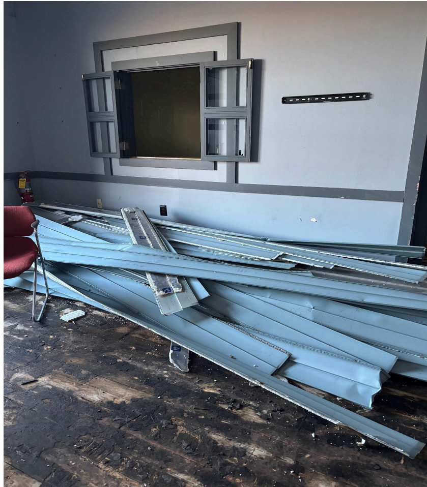
Figure 5: A picture of the siding that was replaced from the wind storm.